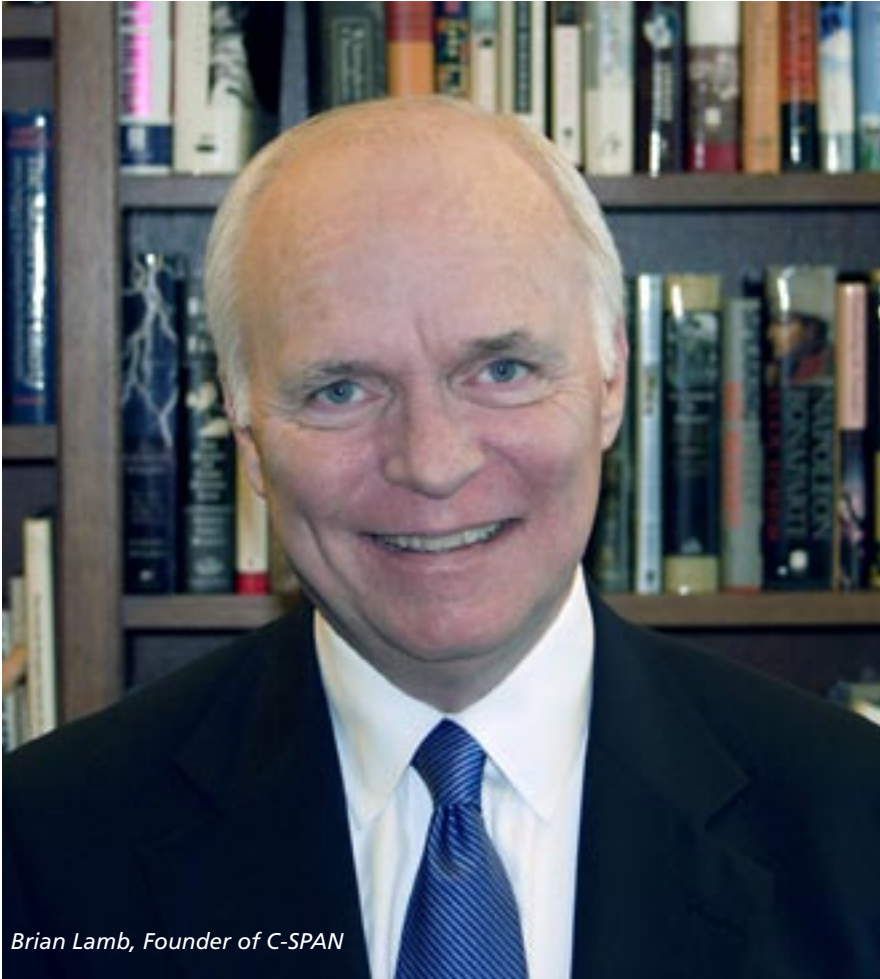
Brian Lamb, Founder of C-SPAN