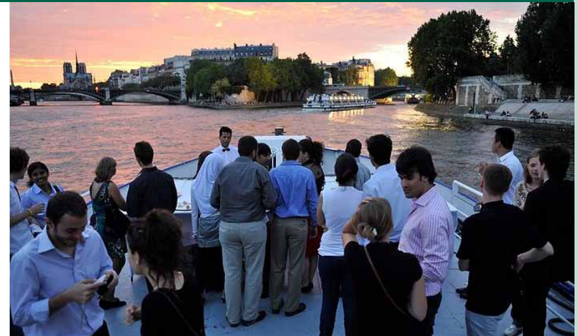
Paris is ours ! Dinner cruise on the Seine river.

The entire group gathers at the beginning of the evening at the seaside, ready to set off for a dinner cruise on the Seine. This coming weekend, students can freely visit the capital, the City of Light. But before leaving: it's party time!