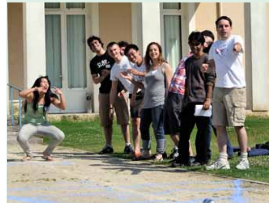
Now it's time for team building!