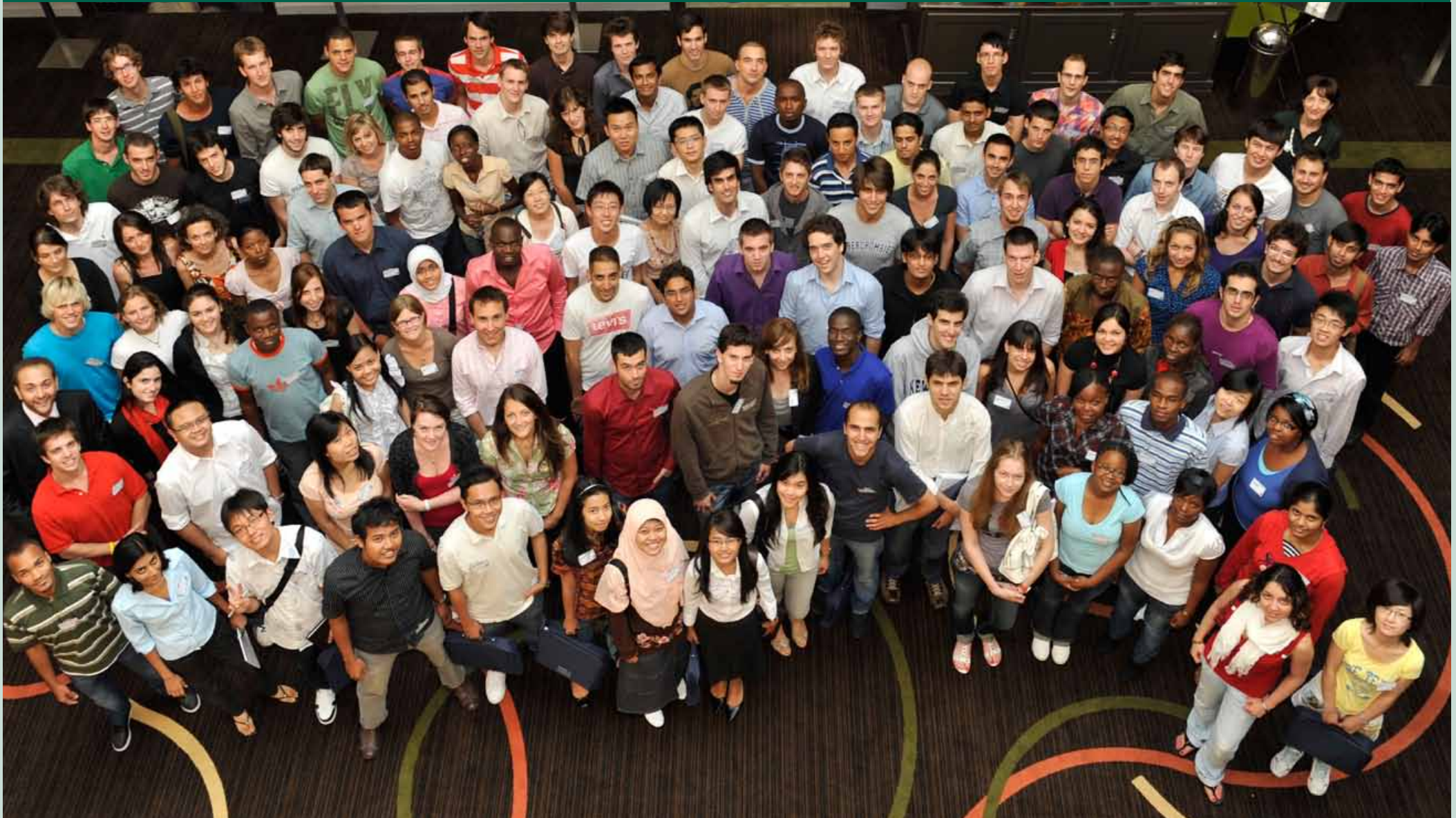
The Total Summer School, class of 2009