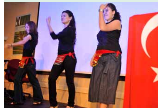
...Turkey: Total University's young guests describe a few of their respective countries' features with humour and creativity.