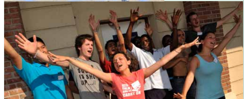
"I believe I can fly" will be the Summer School 2009' official song